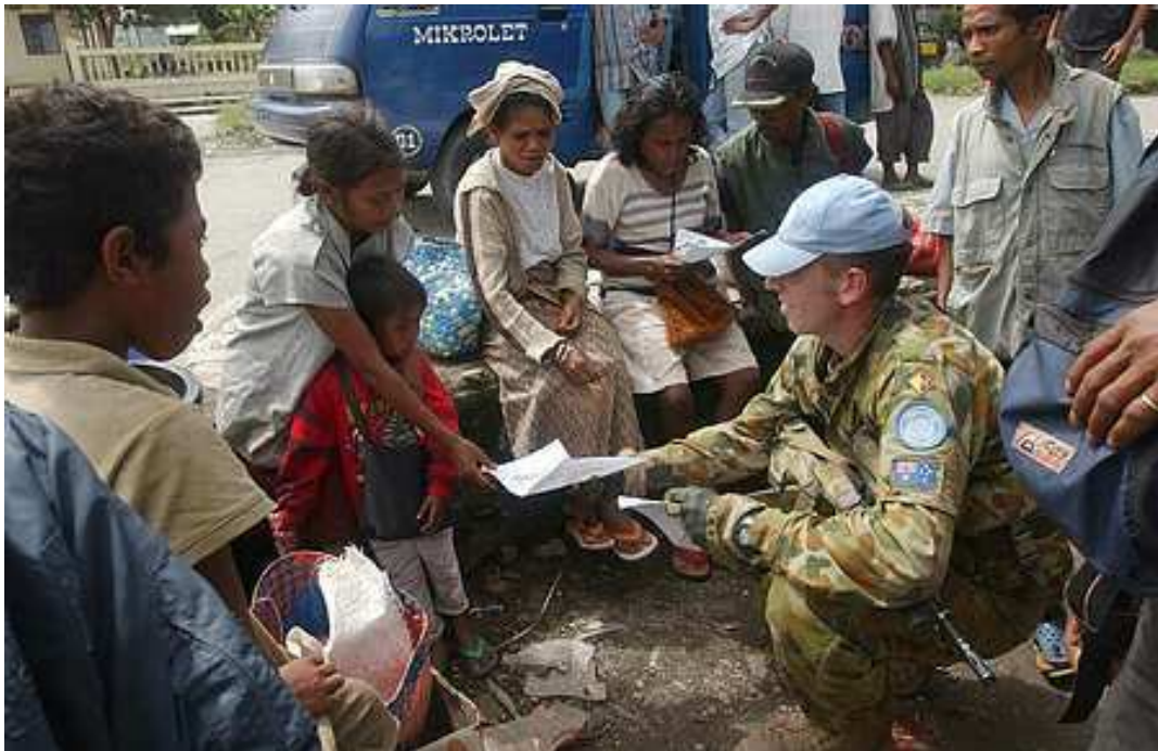
An Australian UN peacekeeper with the Timorese community in Dili c.2003